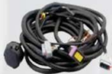
2 CABLE HAMESSES