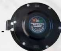
6 CABLE DRUM WITH ANGLE ET LENGTH