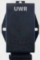
11 UWR-UNIVERSAL WIRELESS RECEIVER