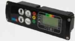
4 SLIM Complete with Central Unit, Graphic LCD Display, and I/O Resources.