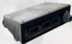
1 MC2M DOUBLE CORE MULTIPURPOSE CONTROLLER