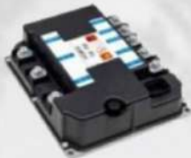
3 TM TRACTION MODULE