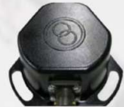
15 planarity sensors : AMV