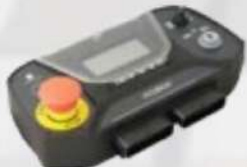
1 TAUR MULTIFUNCTION CONTROLLER ECU