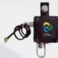
5 A2B LIMIT SWITCH