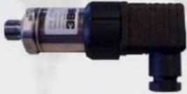
3 PRESSURE TRANSDUCERS