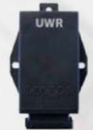
5 UWR-UNIVERSAL WIRELESS RECEIVER