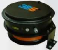
2 CABLE REEL