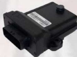
16 IO-CAB Cabin Function Controller for Windshield Wipers, Lamps, Solenoids