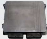
13 PROGRAMMABLE CONTROLLER : LE56