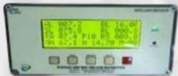
3 DISPLAY UNIT