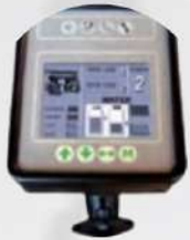
12 DISPLAY CLS