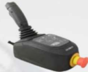
4 SENTAUR MULTIFUNCTION CONTROLLER PCU